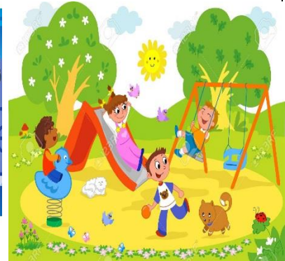
Visit the park