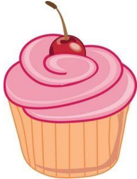
Bake a cake