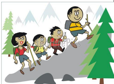
Go somewhere new!