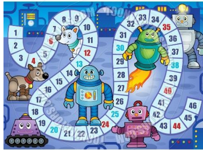
Play a game