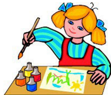
Paint a picture