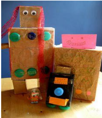
Make a model